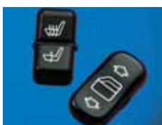
Version Vario RD with options