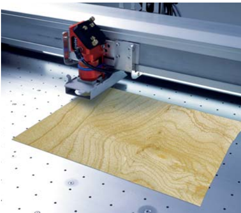
veneer, 0.5 mm (0.02")