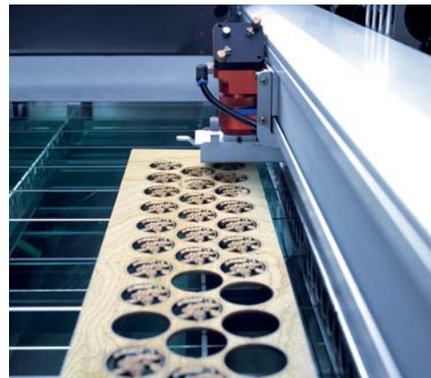
wood, 4 mm (0.16")