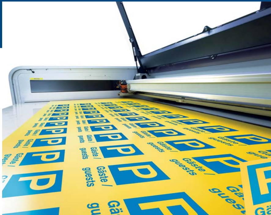
Productivity over the entire production line