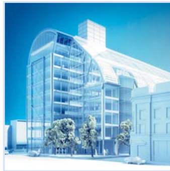
Acrylic and wooden models