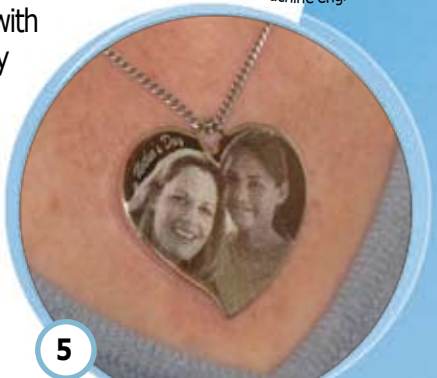
A precious and unique engraving