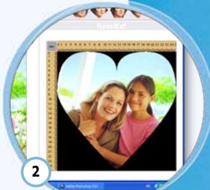
Import and position the photo in the template