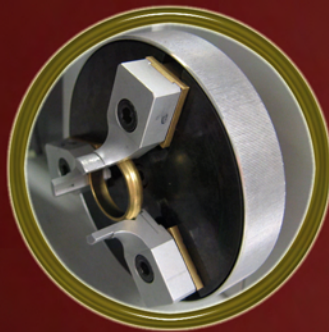
Inside Ring engraving